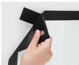
tool: adhesive velcro