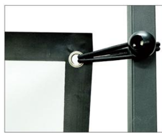
tool: bungee ball